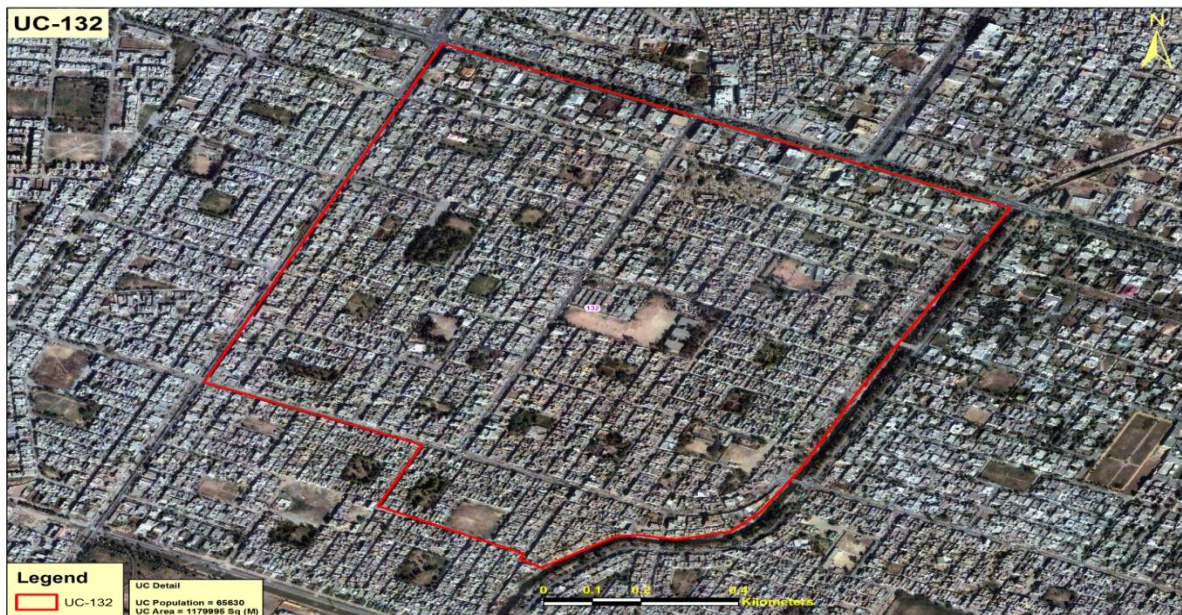
Figure 1: Map of UC 132 Township-1

Union Council – 132 (Township-1) is located in Allama Iqbal Town. Total area of the UC is 1179995 m 2 with population of 65630 1 . This area is predominantly middle income area with planned settlement.